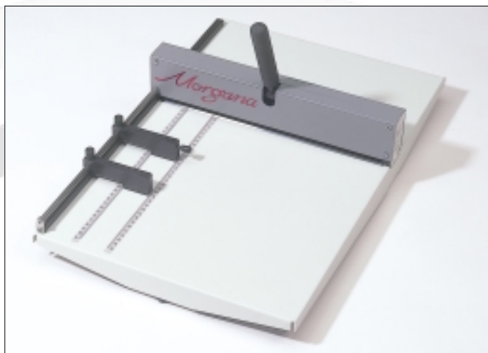
Above: The Morgana Docu-Crease 35.